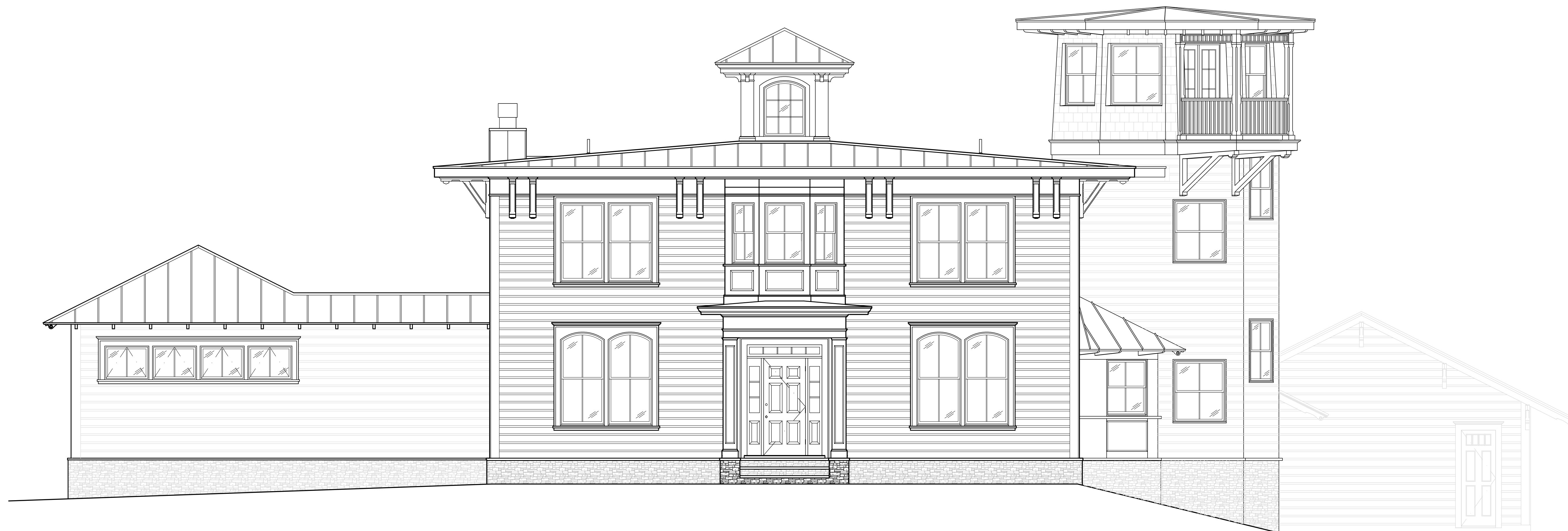
1 PROPOSED - NORTH ELEVATION SCALE: 1/4"=1'-0"