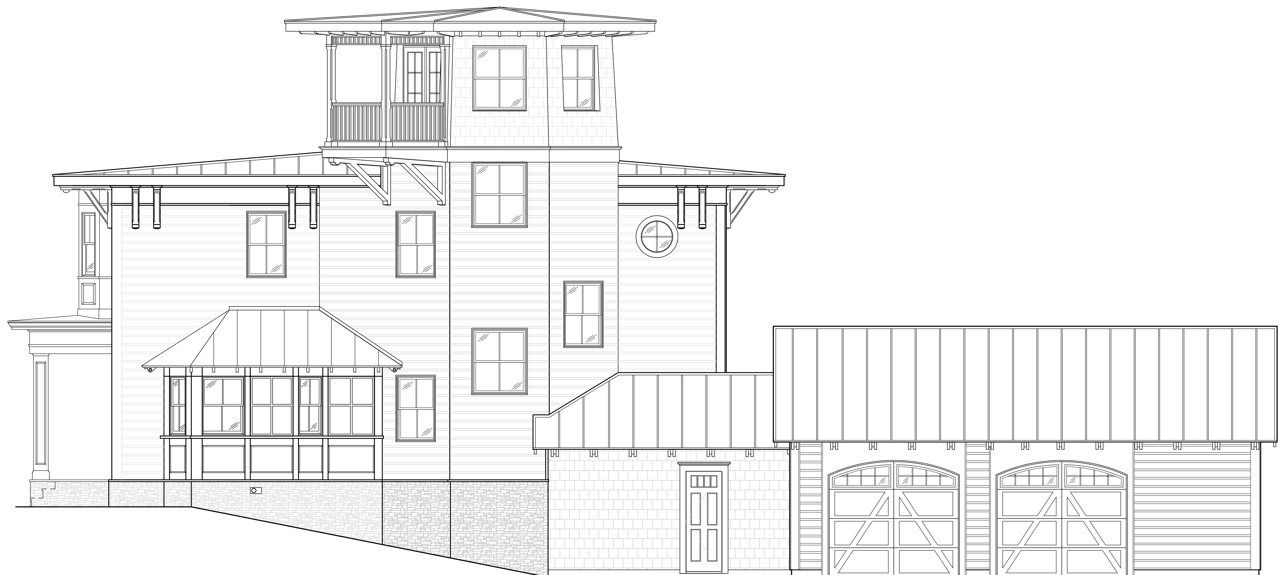
1 PROPOSED - WEST ELEVATION SCALE: 1/4"=1'-0"

NOTES: 1) SEE GENERAL NOTES & PROJECT MANUAL.