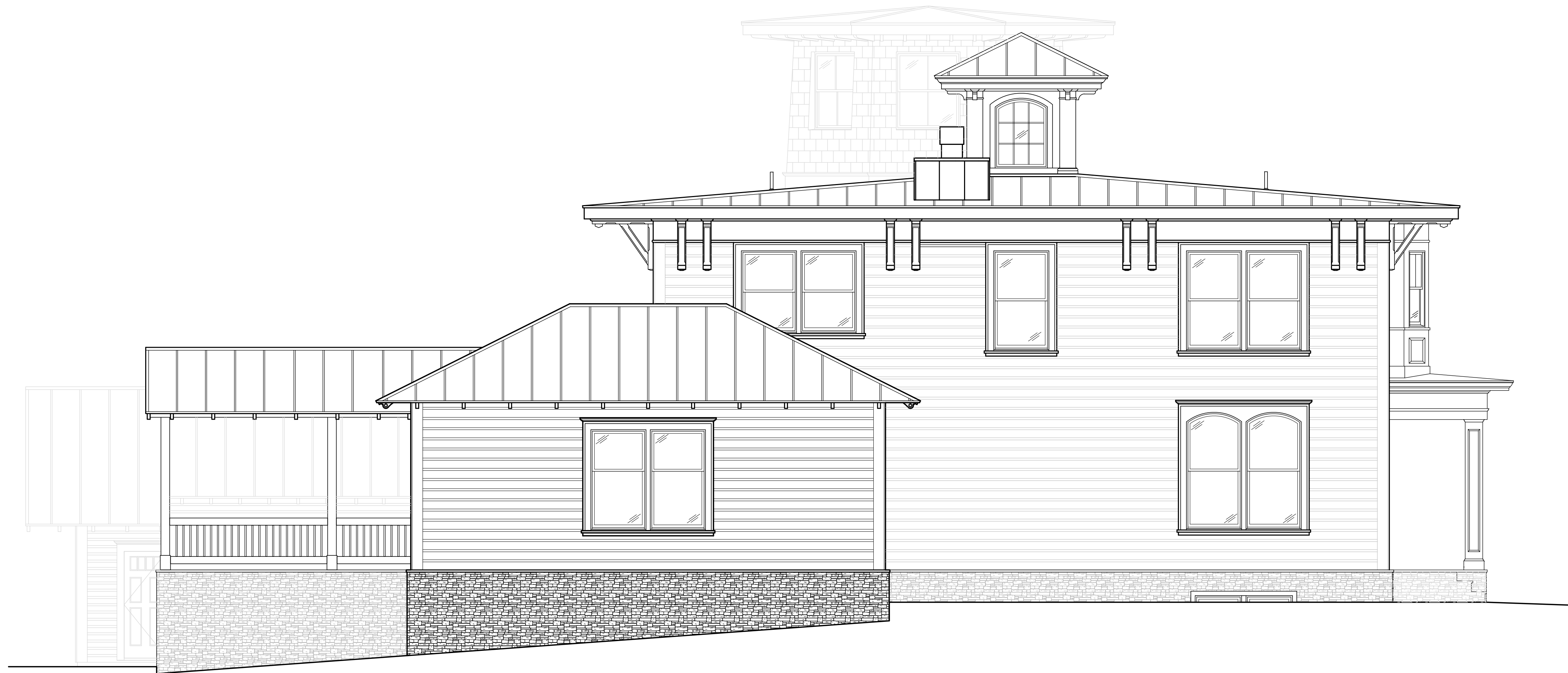
2 PROPOSED - EAST ELEVATION SCALE: 1/4"=1'-0"