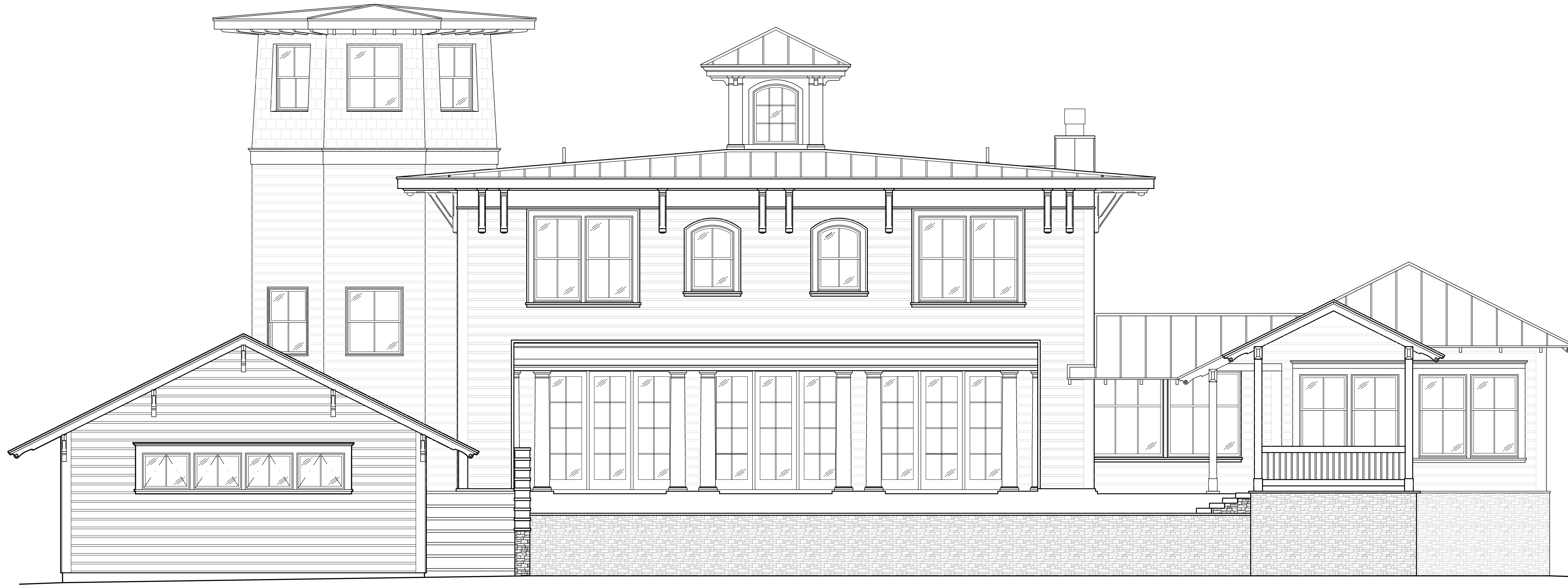
2 PROPOSED - SOUTH ELEVATION SCALE: 1/4"=1'-0"

NOTES: 1) SEE GENERAL NOTES & PROJECT MANUAL.